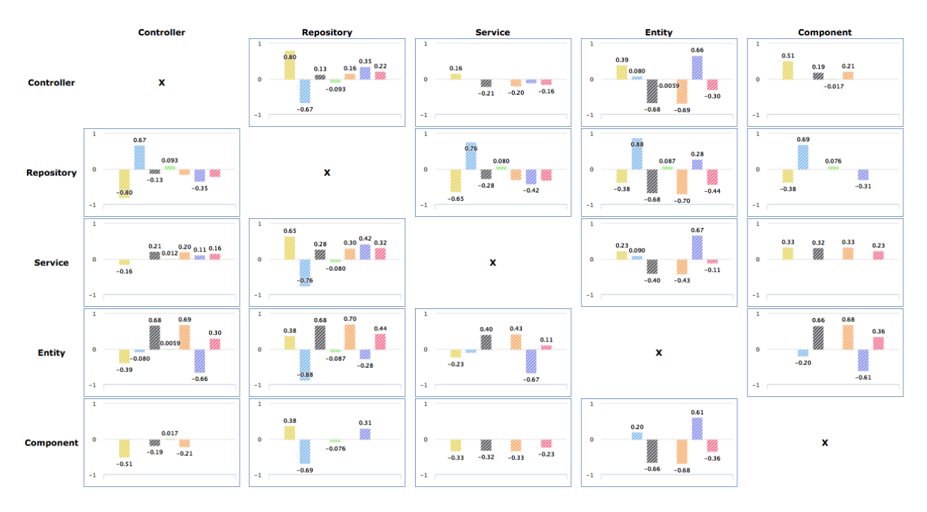
Figure 3: Code metrics distribution in the system (bars, from left to right: Yellow=CBO, Blue=DIT, Black=LCOM, Green=NOC, Orange=NOM, Purple=RFC, Pink=WMC). Striped bars = significant difference (p-value < 0.05), height = Cliff's Delta effect size.

contain more rules that depend upon other classes.